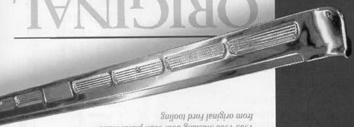
1965-1968 Mustang door scuff plates made from original Ford tooling

Classic Mustang restoration parts made from