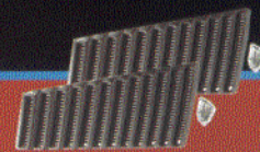
1967-68 Fastback Quarter Vent Assembly