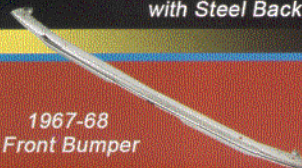
1967-68 Front Bumper