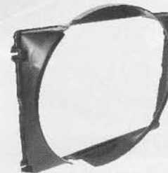
1967-70 Mustang radiator shrouds made from original Ford tooling

FOR A LISTING OF ORIGINAL FORD TOOLING PARTS VISIT