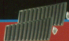
1967-68 Fastback Quarter Vent Assembly