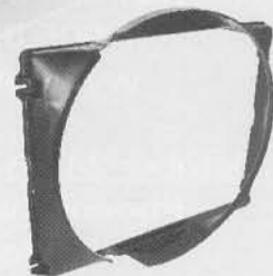
1967-70 Mustang radiator shrouds made from original Ford tooling

FOR A LISTING OF ORIGINAL FORD TOOLING PARTS VISIT