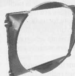
1967-70 Mustang radiator shrouds made from original Ford tooling

FOR A LISTING OF ORIGINAL FORD TOOLING PARTS VISIT