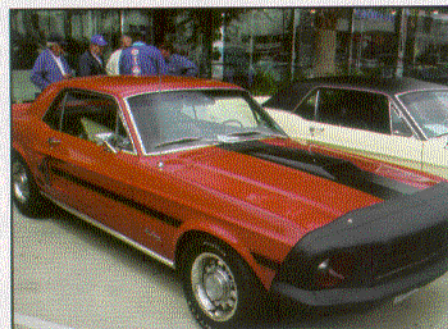
A rare Cobra Jet GT/CS.