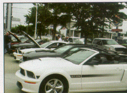
Several late model GT/CS Mustangs were on display. It was a nice contrast in design.