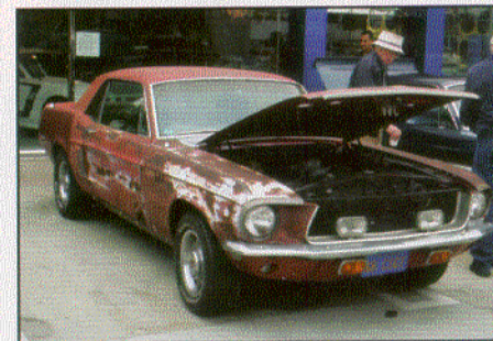
A work in progress! I'm so proud of people who bring their project cars to shows. You can learn so much, and get so much helpful advice.