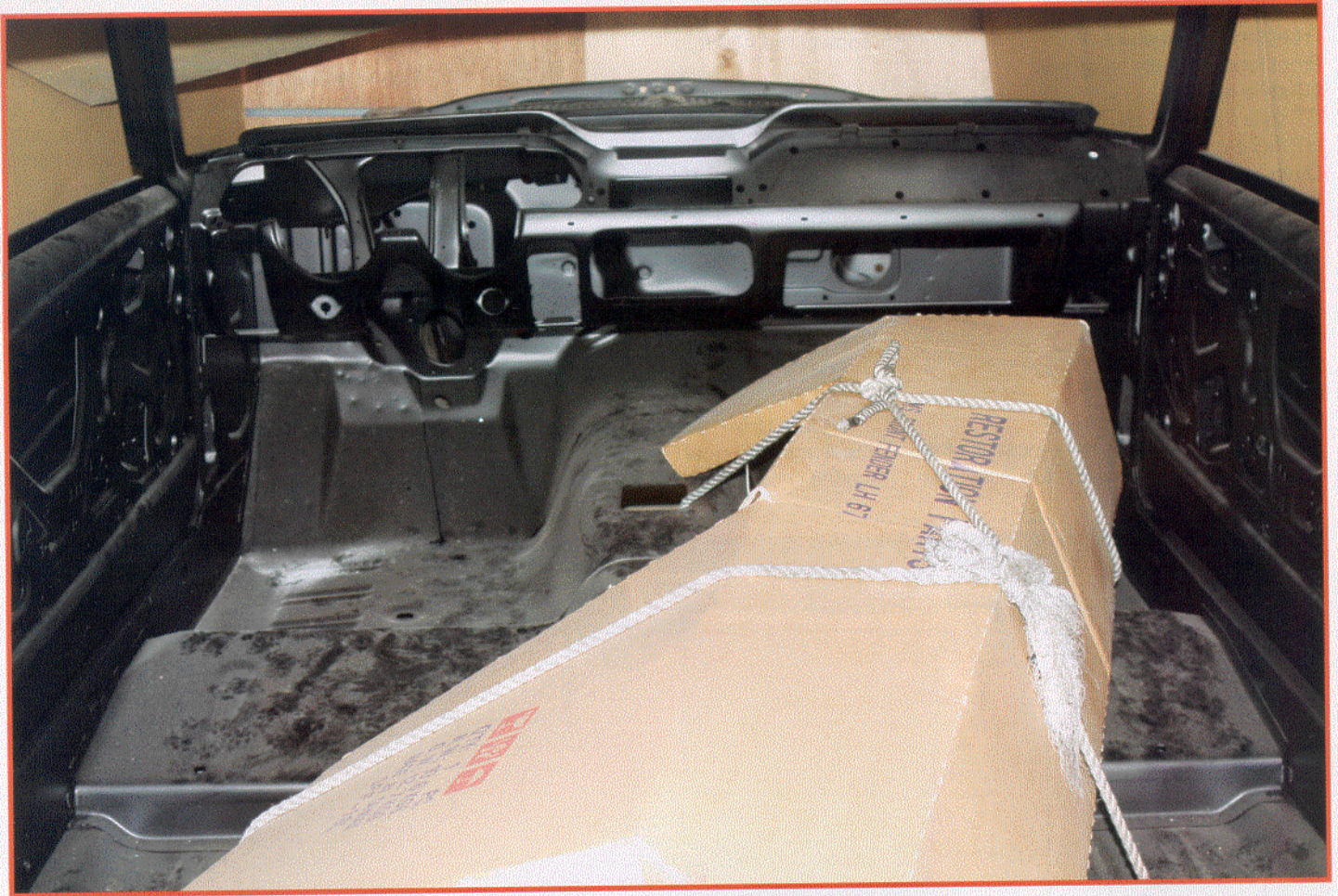
An interior view