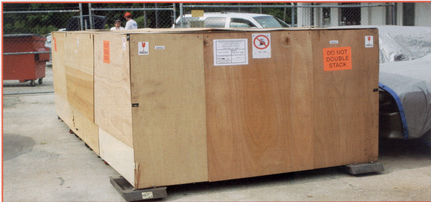
The big crate that contains the Dynacorn body.

So, although we're on our way, we have an extremely long way to go. Your support, your contributions, your well wishes, and your prayers are greatly appreciated. MT