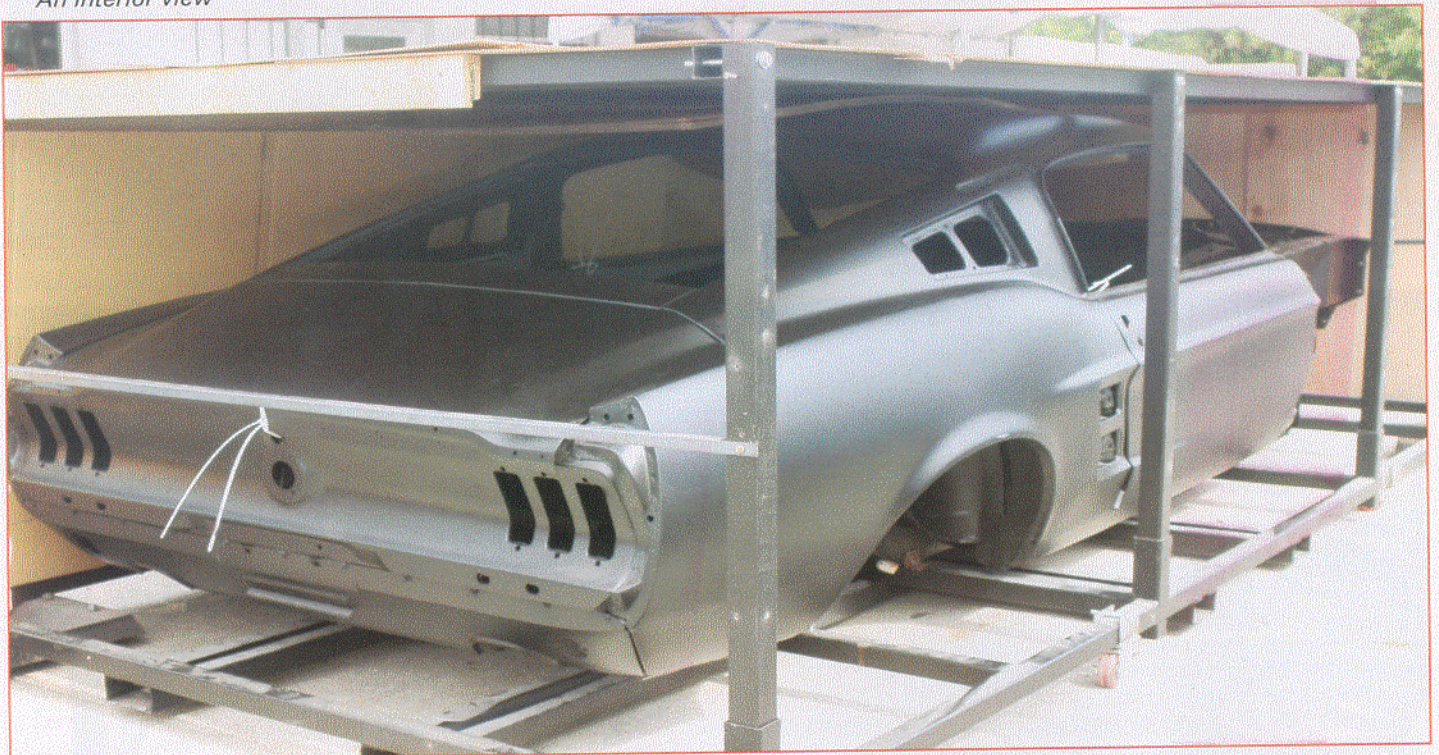
Of course, what photoshoot would be complete without the rear shot?