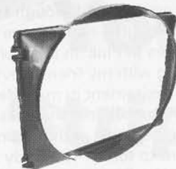
1967-70 Mustang radiator shrouds made from original Ford tooling

FOR A LISTING OF ORIGINAL FORD TOOLING PARTS VISIT