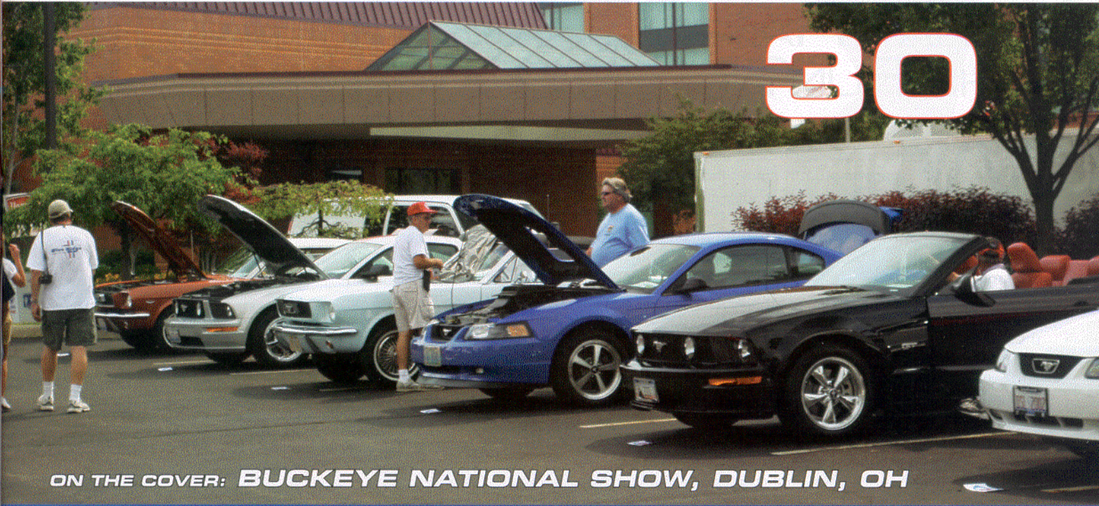
ON THE COVER: BUCKEYE NATIONAL SHOW, DUBLIN, OH