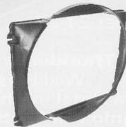
1967-70 Mustang radiator shrouds made from original Ford tooling

FOR A LISTING OF ORIGINAL FORD TOOLING PARTS VISIT