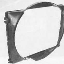
1967-70 Mustang radiator shrouds made from original Ford tooling

FOR A LISTING OF ORIGINAL FORD TOOLING PARTS VISIT