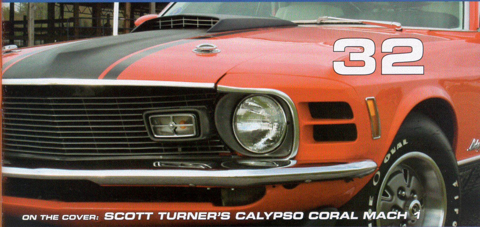
ON THE COVER: SCOTT TURNER'S CALYPSO CORAL MACH 1