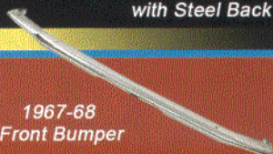
1967-68 Front Bumper