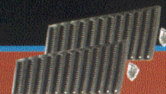
1967-68 Fastback Quarter Vent Assembly