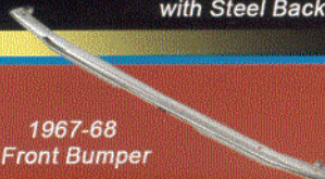
1967-68 Front Bumper