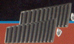
1967-68 Fastback Quarter Vent Assembly