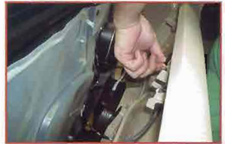
▲ One more door panel and you're done.