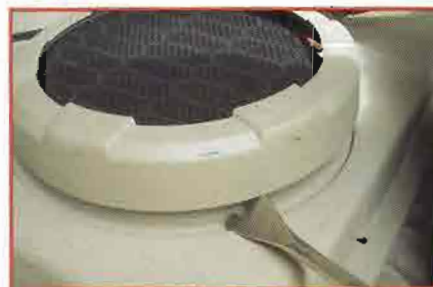
▲ Pry cover off factory speaker.