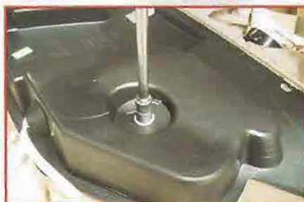
▲ Remove the bolt on the back of the door panel that holds the 8-inch woofer.