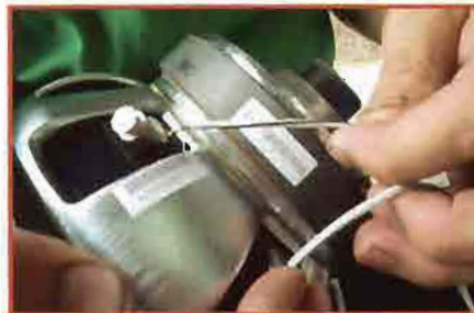
▲ Strip the white wire with the black stripe and the white wire with the grey stripe about 1/2-inch. The black and white one goes to the black connector, the grey and white one goes to the red connector. The two remaining wires are tied off; be sure to insulate them to prevent accidental grounding.