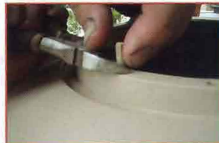
▲ Snip off the plastic speaker alignment pin on the door panel.