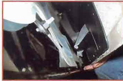
▲ When reinstalling the door panel, be sure to line up the two clips on the bottom before snapping in the top.