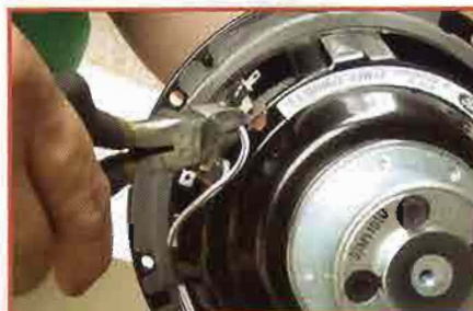
▲ Cut the 4 wires and remove the speaker.