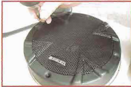
▲ Screw the Shelby speaker cover on.