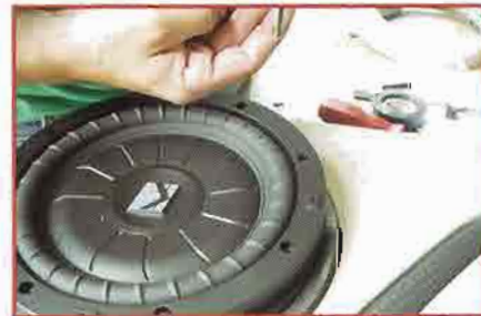
▲ Screw the speaker to the spacer, install insulator and bolt on the back.