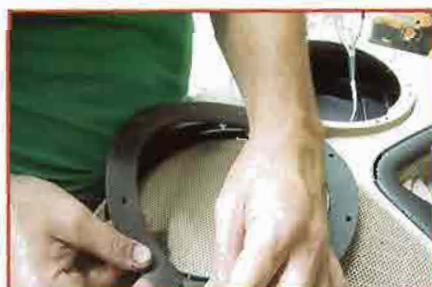
▲ Install a gasket on the spacer, door panel side.