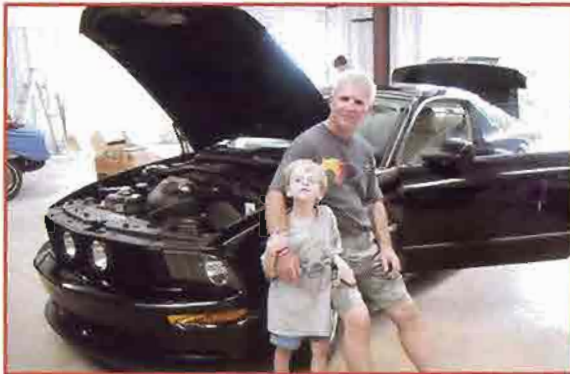
▲ Install the fuses under the hood and another Mustang is ready to go Kickin' off into the sunset.