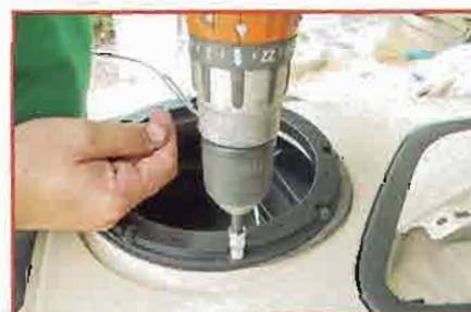
▲ Screw the spacer to the door panel with the supplied screws.