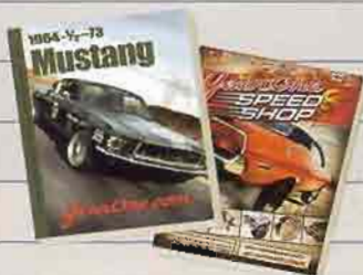
Mustang (1964 1/2 - 73) Printed Catalog Mustang (1979-Present) Online Only YearOne SpeedShop Performance