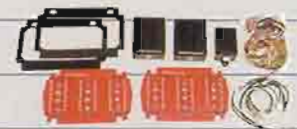
1967-68 LED Tail Light Kit Part #: ST203