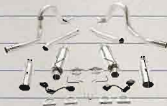
1996-98 Magnaflow Exhaust Kit Part #: 1F78-15677