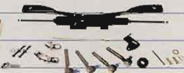
1968-70 Rack and Pinion Kit Part #: 800088001