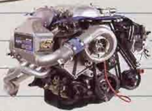
1996-98 Vortech Supercharger Kit Part #: VS73C