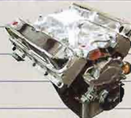
351W 400hp Crate Engine Part #: CT351PC1