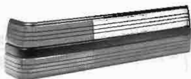
1983-1986 Mustang Taillight Lens

For quality assured Mustang parts look for the Original Ford Tooling and Daniel Carpenter labels.