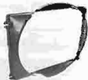
1967-1970 Mustang Radiator Shroud