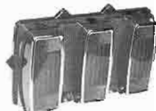
1965-1969 Mustang Taillight Lenses