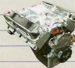
351W 400hp Crate Engine Part #: CT351PC1