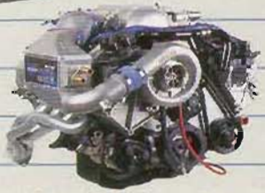
1996-98 Vortech Supercharger Kit Part #: VS73C