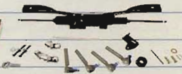
1968-70 Rack and Pinion Kit Part #: 800088001