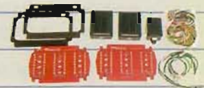
1967-68 LED Tail Light Kit Part #: ST203