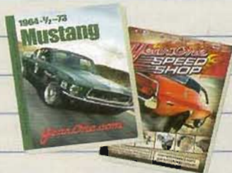
Mustang (1964 1/2 -73) Printed Catalog Mustang (1979-Present) Online Only YearOne SpeedShop Performance