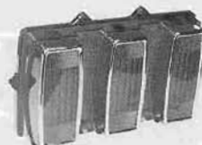
1965-1969 Mustang Taillight Lenses