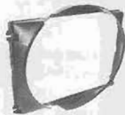
1967-1970 Mustang Radiator Shroud