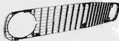
1969-1973 Mustang Grille

FOR A LISTING OF ORIGINAL FORD TOOLING PARTS VISIT www.dcmustang.com