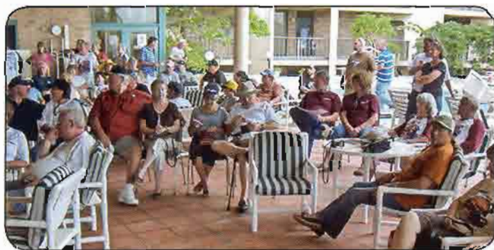
▲ Awards were presented poolside at the luxurious host hotel, The Dunes.