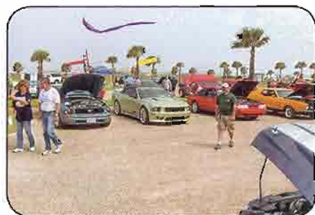
▲ The car show was held at Island Moorings Yacht Club & Marina on Mustang Island.