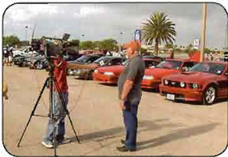
▲ Mustangs cruised to Corpus Christi's ABC affiliate, KIII-TV Channel 3. Their camera man was awaiting their arrival.