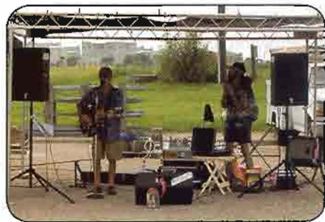
▲ Local musical group called Beatnack entertained the gathering with an assortment of '60s and '70s songs.