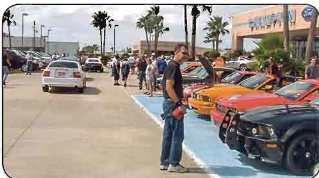
▲ Champion Ford in Corpus Christi, Texas, hosted our first stop.