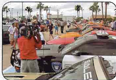
▲ It was a tight fit, but we managed to get all 77 Mustangs parked at the Champion Ford dealership.

For our final day on the island, we assembled at the host hotel: The Dunes. The Dunes is a luxury facility with all the features and amenities you could ask for. Island Tom, a master of the mic, took charge of the