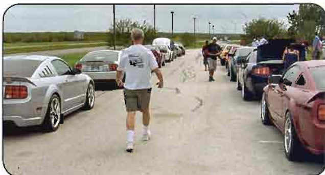
▲ All lined up and ready to go!