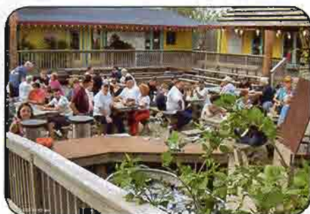
▲ Mustangers from the cruise began assembling at Pelican's Landing on Mustang Island.