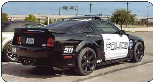
▲ A 2005 Saleen Mustang, painted and equipped to replicate the Mustang in the movie, "Transformers." It attracted much attention all weekend.