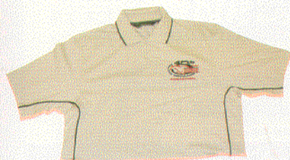
Dri-Fast Sport Shirt $41