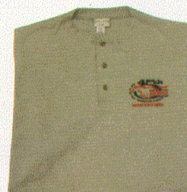
Cotton Henley $24