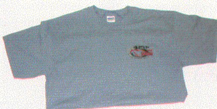
Light Blue T-shirt $15