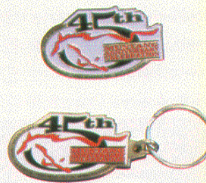
Hat Pin / Key Chain $5

Shipping and handling charges will compute on the check-out page of the website. International customers are responsible for Import Duty Fees. Log onto www.mustang.org and click on the link to the 45th Anniversary show to purchase any of these products.