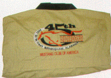
Khaki Jacket $72