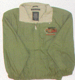
Olive Jacket $72

Visit www.mustang.org click on the 45th Anniversary logo.