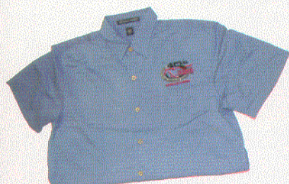
Camp Shirt $43