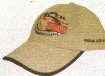
Khaki Cap $15