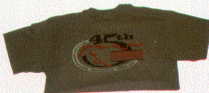
Charcoal T-shirt $15