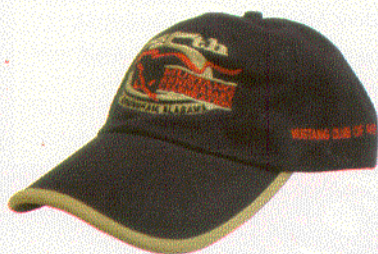
Navy Cap $15