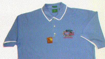
Blue Polo $39