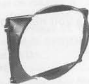
1967-1970 Mustang Radiator Shroud