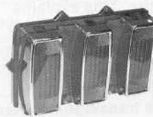
1965-1969 Mustang Taillight Lenses