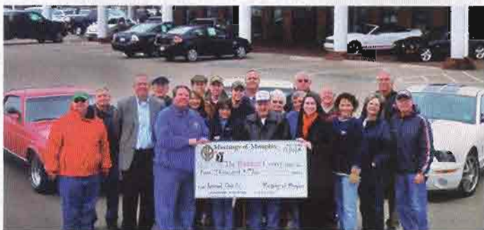
Text by Darrell Mims

On October 4, 2008, The Mustangs of Memphis regional MCA club hosted their 27 th annual charity car show. Aided by Chamber-of-Commerce weather, this year's 110-registered participants was the largest group in recent memory. In addition to the registered cars, our club members displayed 27 of their Mustangs for total of 137 vehicles on the show field. Our show always has a good representation of new and old Mustangs with an interesting variety of other Ford-powered vehicles thrown in to spice up the mix. This year's event was no exception with everything from bone-stock, concours-level restorations, to highly modified, fire-breathing street machines from as far away as Florida and Texas.