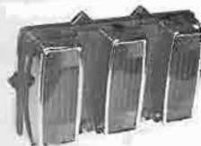
1965-1969 Mustang Taillight Lenses