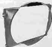
1967-1970 Mustang Radfator Shroud