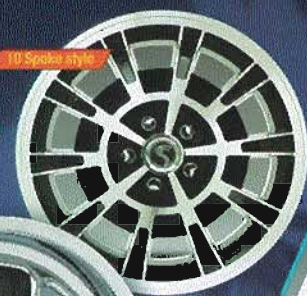
10 Spoke style

Quality replacement wheels for early and late model Mustangs. Manufactured from premium quality, light weight cast aluminum. This SS style wheel is a beautiful chrome plated version of the original 14x5" steel wheel offered on 1965-67 Mustangs. (Other styles available)