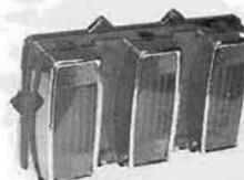
1965-1969 Mustang Taillight Lenses