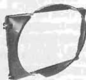
1967-1970 Mustang Radiator Shroud