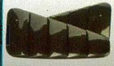
Removable Window Louvers