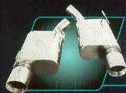
Add style and increase performance

T304 stainless steel axle back exhaust for 2005-08 Mustang GT 4.6 liter, fully polished from end to end with double wall tips