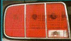
Chrome tailight bezel

Two tone Console Cushion and Shifter Boot, screaming yellow w/ charcoal black. Two tone Door Handle, Headrest, emergency brake accents. Available in all popular OEM colors