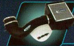
Cold Air Intake Box

Early model retro-fitted badge fits your late model Mustang for that classic look