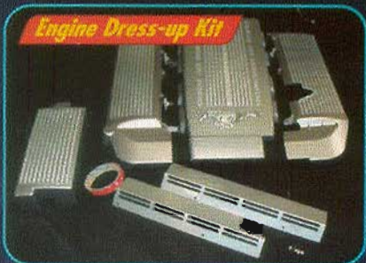
Engine Dress-up Kit

Our new Hood Lift Kits are available in all popular OEM colors. The rigid design provides an effortless operation, a cleaner look & eliminates the stock prop rod.