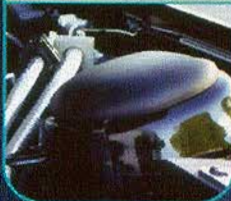
Shock Tower Covers

Molded in black textured finish to match OEM radiator cover panel