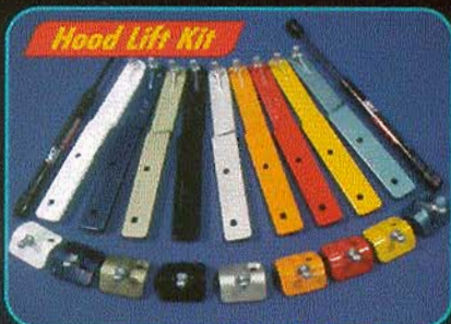
Hood Lift Kit

Our new Hood Lift Kits are available in all popular OEM colors. The rigid design provides an effortless operation, a cleaner look & eliminates the stock prop rod.