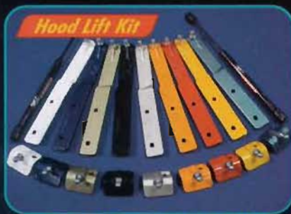
Hood Lift Kit

Our new Hood Lift Kits are available in all popular OEM colors. The rigid design provides an effortless operation, a cleaner look & eliminates the stock prop rod.