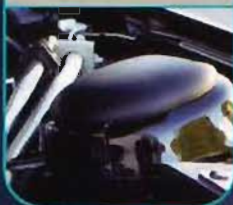
Shock Tower Covers

Welded in black textured finish to match OEM radiator cover panel