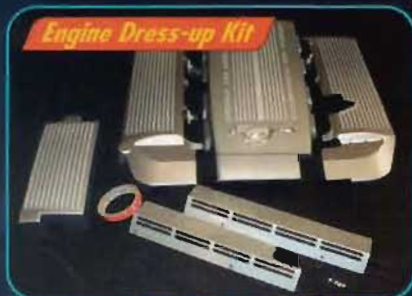
Engine Dress-up Kit

Our new Hood Lift Kits are available in all popular OEM colors. The rigid design provides an effortless operation, a cleaner look & eliminates the stock prop rod.