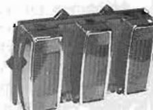
1965-1969 Mustang Taillight Lenses