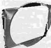
1967-1970 Mustang Radiator Shroud