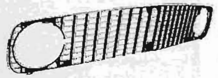
1969-1973 Mustang Grille

FOR A LISTING OF ORIGINAL FORD TOOLING PARTS VISIT