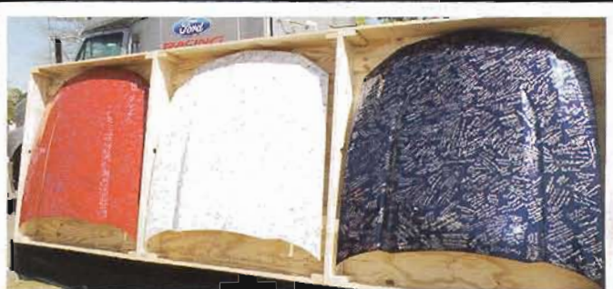
Ford had attendees sign these hoods. Currently, they are in the Barber Museum, although no one really knows if they are on display or not.