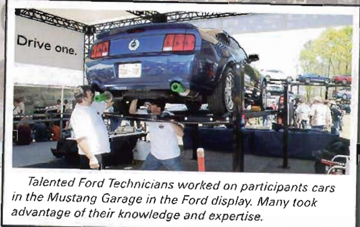
Talented Ford Technicians worked on participants cars in the Mustang Garage in the Ford display. Many took advantage of their knowledge and expertise.