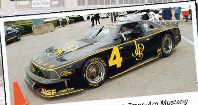
The Johnny Player Special Roush Trans-Am Mustang was on display.