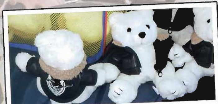
These adorable 45 th Anniversary Bears are sold to benefit Juvenile Diabetes. Check page 45 for more information.