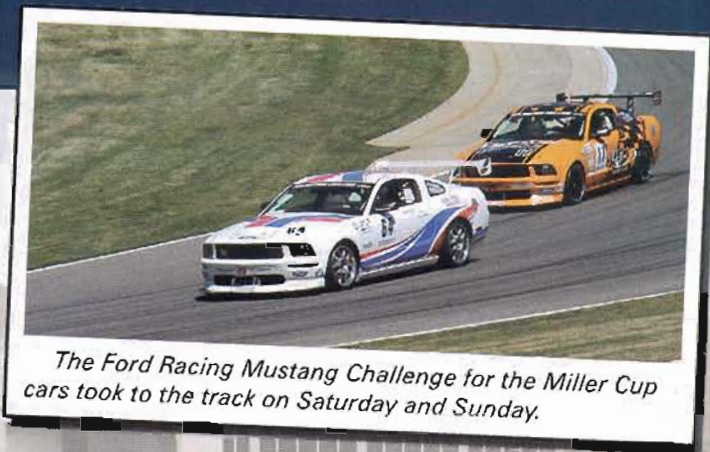
The Ford Racing Mustang Challenge for the Miller Cup cars took to the track on Saturday and Sunday.