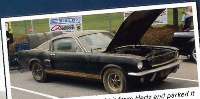
This Shelby's owner bought it from Hertz and parked it after a few years of driving it. He realizes it's more valuable in its current condition than if he washed it!