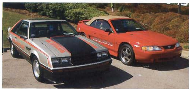
A pair of Indianapolis 500 Pace Cars, 1984 and a 1994. Quite a sight!