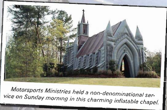
Motorsports Ministries held a non-denominational service on Sunday morning in this charming inflatable chapel.