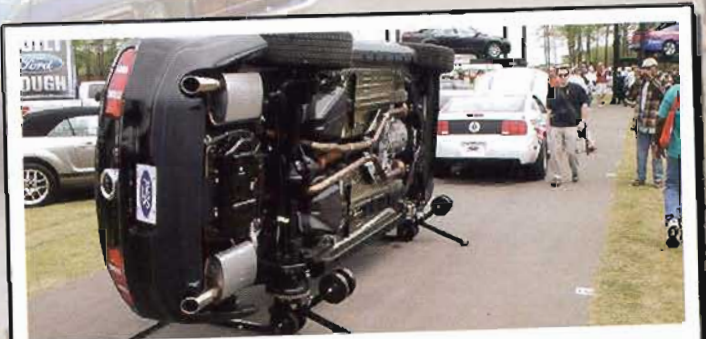
Wasn't it nice of Ford to give the MCA judges an opportunity to document the undercarriage of the 2010?