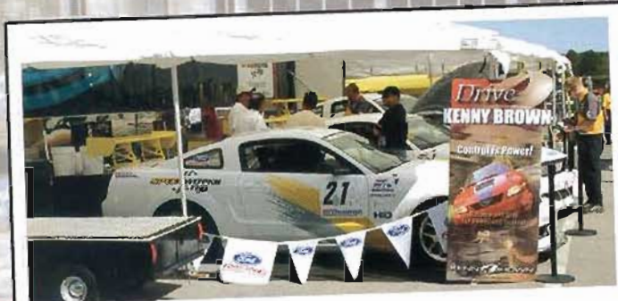
It was good to see Kenny Brown in the Paddock area and back in action.