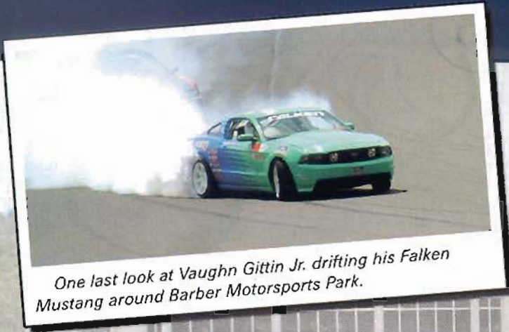
One last look at Vaughn Gittin Jr. drifting his Falken Mustang around Barber Motorsports Park.