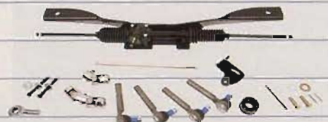
1968-70 Rack and Pinion Kit Part #: 800088001

Mustang (1964 1/2 -73) Printed Catalog Mustang (1979-Present) Online Only YearOne SpeedShop Performance