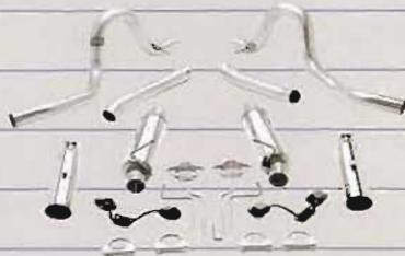
1996-98 Magnaflow Exhaust Kit Part #: 1F78-15677