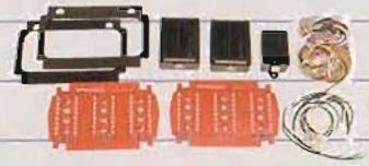
1967-68 LED Tail Light Kit Part #: ST203