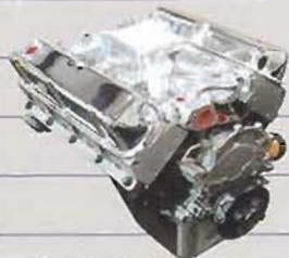
351W Crate Engine Part #: CT351PC1