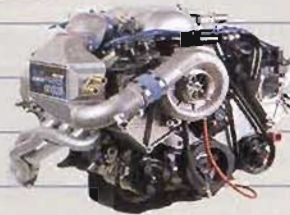
1996-98 Vortech Supercharger Kit Part #: VS73C