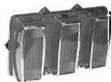
1965-1969 Mustang Taillight Lenses