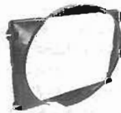
1967-1970 Mustang Radiator Shroud