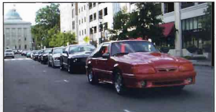
"Cruise to the Capital" participants arrive in downtown.