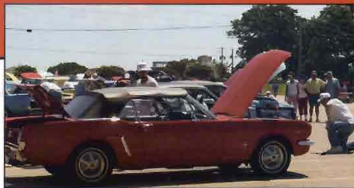
The judges worked hard to get all cars judged on time.