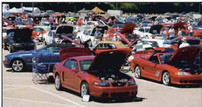
The American Stampede show field overview.