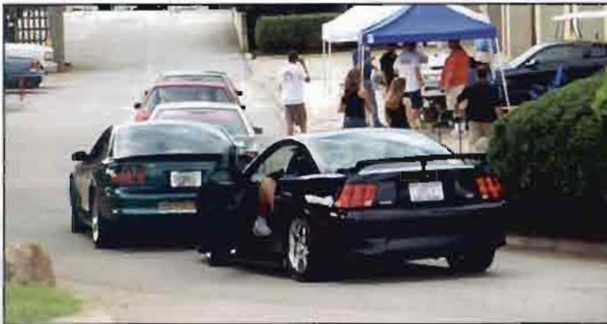
Registration was also a busy place on Friday and Saturday.