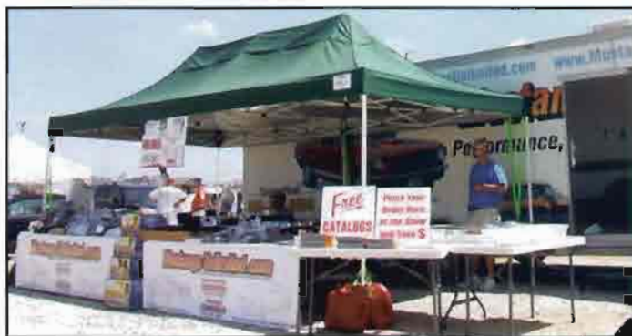
Mustangs Unlimited was just one of many vendors.