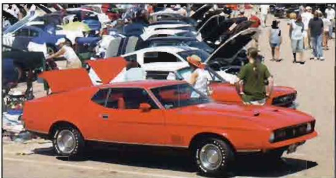
Early Generation Mustangs on the show field.