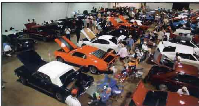
The Kerr Scott building was a prime location for show cars.