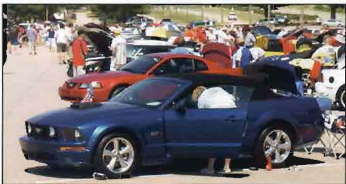
Late model Mustangs graced the show field.