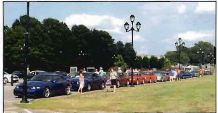
Mustangs line up to leave for the Friday night cruise.