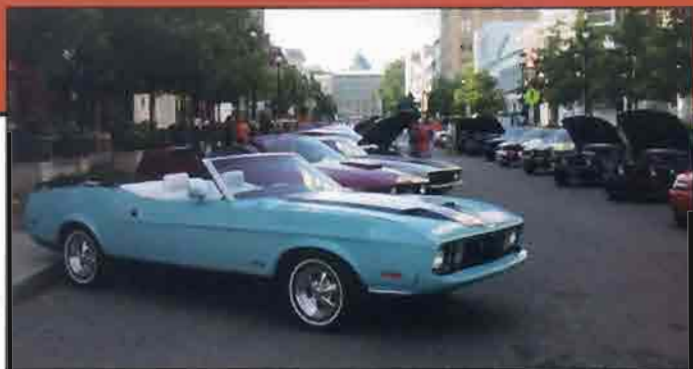
Mustangs lined Fayetteville Street in downtown Raleigh.