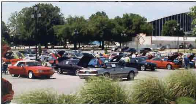
The show fields began to fill quickly on Friday.