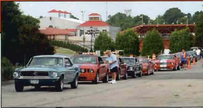
Classification had a steady line Friday and Saturday.