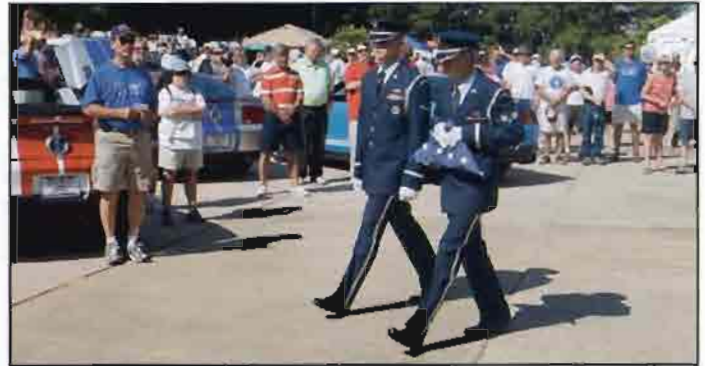
The Honor Guard brings the flag for Opening Ceremonies.