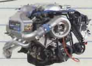
1996-98 Vortech Supercharger Kit Part #: VS73C