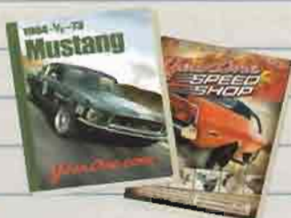
Mustang (1964 1/2-73) Printed Catalog Mustang (1979-Present) Online Only YearOne SpeedShop Performance