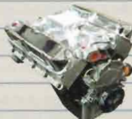
351W 400hp Crate Engine Part #: CT351PC1