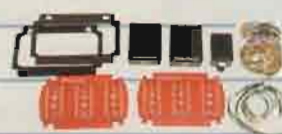
1967-68 LED Tail Light Kit Part #: ST203