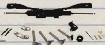
1968-70 Rack and Pinion Kit Part #: 800088001