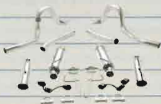
1996-98 Magnaflow Exhaust Kit Part #: 1F78-15677