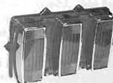
1965-1969 Mustang Taillight Lenses