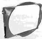
1967-1970 Mustang Radiator Shroud