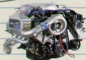
1996-98 Vortech Supercharger Kit Part #: VS73C