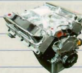
351W 400hp Crate Engine Part #: CT351PC1