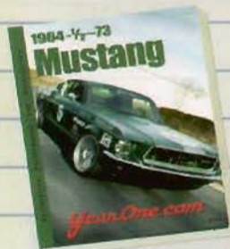
Mustang (1964 1/2 - 73) Printed Catalog Mustang (1979-Present) Online Only YearOne SpeedShop Online Only