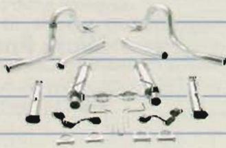
1996-98 Magnaflow Exhaust Kit Part #: 1F78-15677