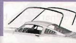
1965-1993 Mustang Weatherstripping