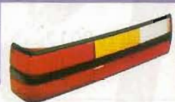
1965-1993 Mustang Taillight Lenses