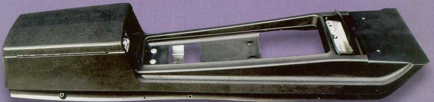
1969-1970 Ford Mustang console assembly shown with compartment lid. Lid sold separately.