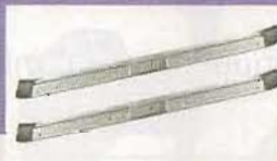
1965-1993 Mustang Scuff Plates