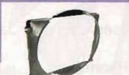
1967-1993 Mustang Fan Shrouds