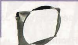
1967-1993 Mustang Fan Shrouds