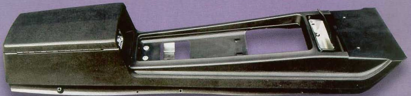
1969-1970 Ford Mustang console assembly shown with compartment lid. Lid sold separately.