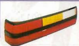
1965-1993 Mustang Taillight Lenses