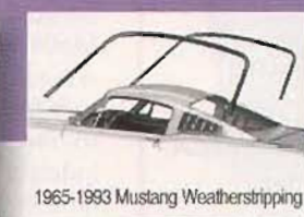
1965-1993 Mustang Weatherstripping