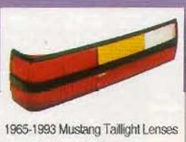
1965-1993 Mustang Taillight Lenses