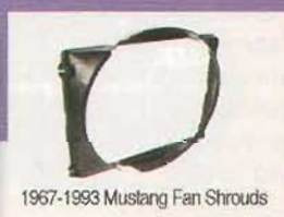
1967-1993 Mustang Fan Shrouds