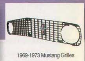
1969-1973 Mustang Grilles