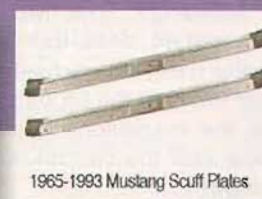
1965-1993 Mustang Scuff Plates