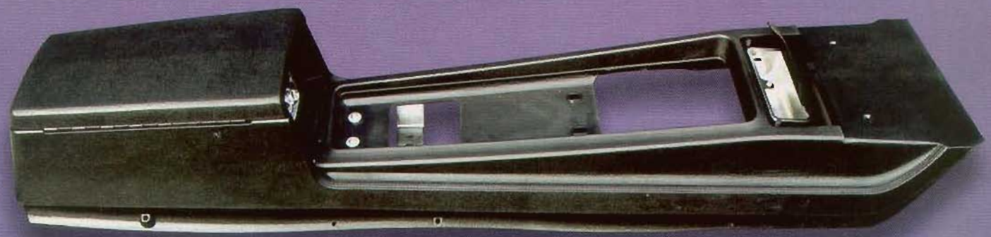
1969-1970 Ford Mustang console assembly shown with compartment lid. Lid sold separately.