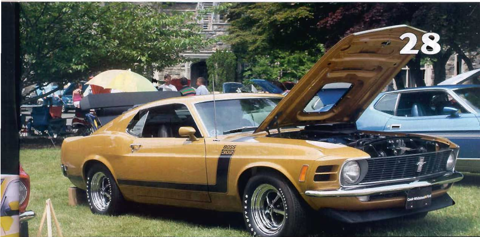
ON THE COVER: The entrance to the Hempstead House at the Sands Point Preserve made for a great cover shot of the Mustangs at the Beach National Show.