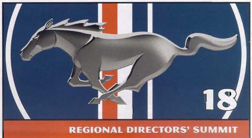
REGIONAL DIRECTORS' SUMMIT