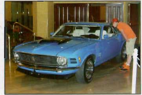
▲ Among the feature cars in the hotel lobby was this Boss 429 Mustang. Not just any Boss 429, but the first 1970 model produced.