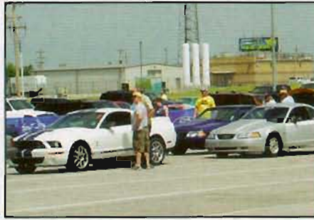
▲ Mustangs and Shelbys from every decade join in the fun at the drags.