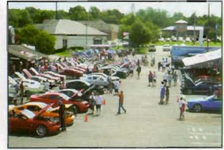
▲ A partial view of the car show and some of the manufacturer's exhibits.