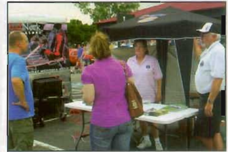
▲ MCA Oklahoma Mustang Club Region members set up the display complete with issues of Mustang Times.