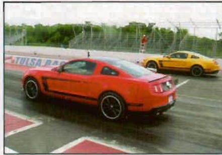
▲ 2012 Boss 302 vs. 2012 Boss 302 on the Tulsa Raceway strip.