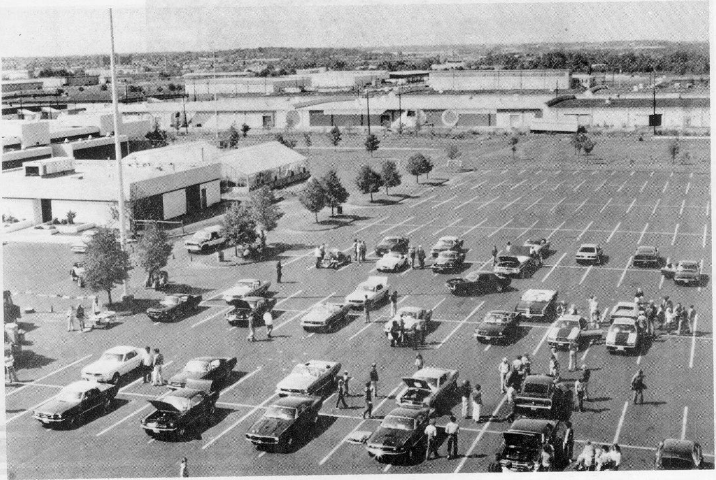
Tri State of Cincinnati's First Annual Mustang Display.