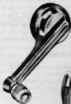
1965-66-67 REAR QUARTER WINDOW HANDLE AND KNOB