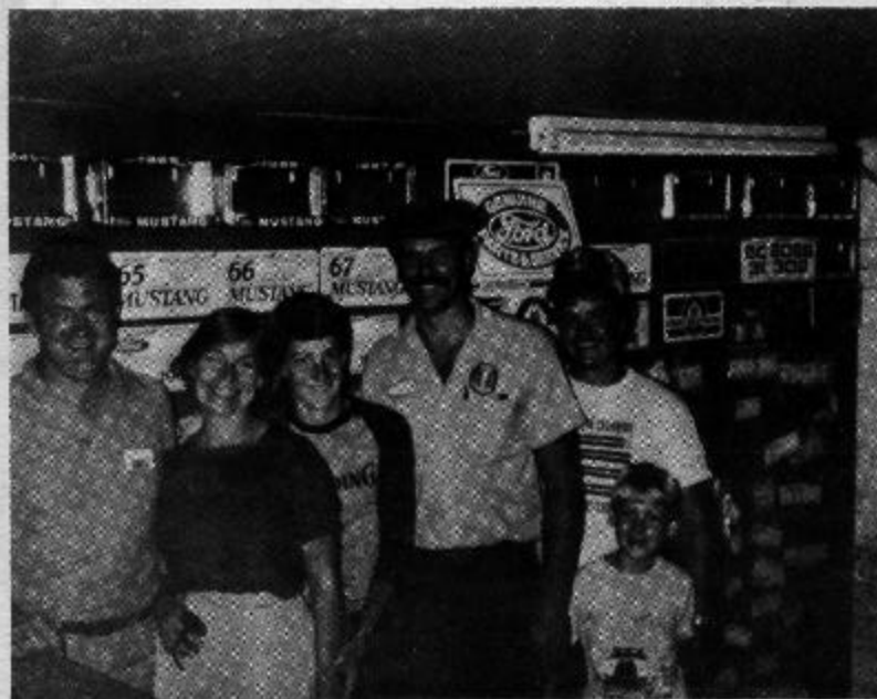
The Crew at Glazier's.

You are in Valley Forge, Pennsylvania, the 1982 Grand National is over, and you feel all down in the dumps. What do you do? You get together with some great people and take a drive out to Souderton, Pennsylvania and Glazier's Mustang Barn.