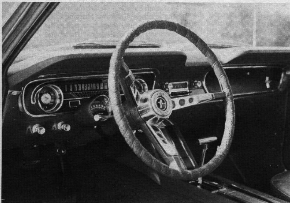
Optional equipment includes a rally pac and console.