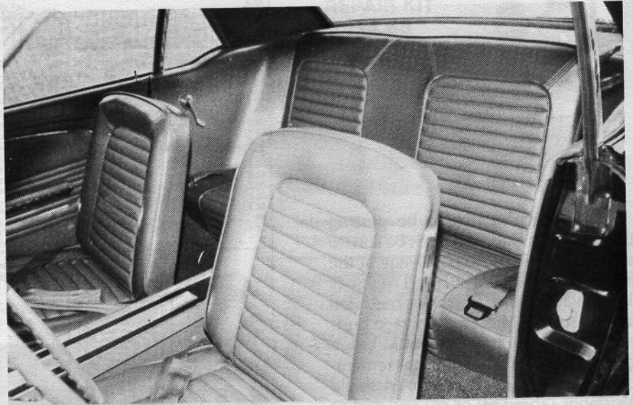
Standard interior with console.